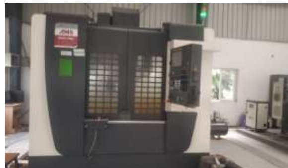
Fig. Error! No text of specified style in document. CNC vertical milling machine

Nowadays CNC machines are widely used for manufacturing complicated parts and used for high production rate with accurate in less time. In this we are using 3 axes CNC vertical milling machine where the spindle is moved in horizontal direction. In this the spindle moves and work piece remains constant in its position. The movements of spindle in XYZ are as follows in figure 3: The movement of the spindle in X direction is forward and backward movement The movement of the spindle in Y direction is front and back direction. The movement of the spindle in Z direction is up and down direction.